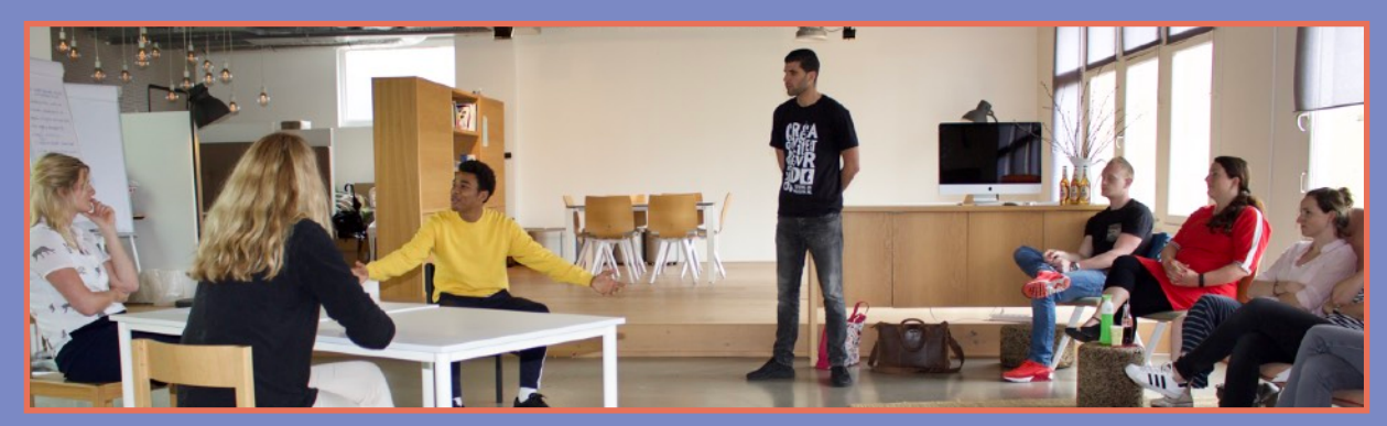
The YiP Youth Lab is active in Kenya, Malawi and the Netherlands. In 2017, the YiP Youth Lab reviewed plans of the Dutch Custodial Institutions Agency to completely redesign custodial juvenile care. YiP Youth Lab is officially part of the public juvenile prosecutors training curricula since 2018.

The Youth Lab of Young in Prison (YiP) is a select group of youth who use their past experience in youth detention to improve the juvenile justice sector. Through creative and expressive workshops, they engage in meaningful exchange with a range of actors – such as prosecutors, prison staff, lawyers and parole officers.