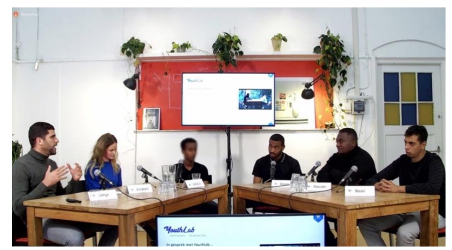
Photo: the online learning event organised by the Youthlab (Young in Prison)

Another activity of the programme was the online learning event that YiP organised in October. Professionals and NGOs in the field of closed (forensic) youth care were given an insight into the different assignments offered by Youthlab. At the same time, they were offered new ideas on how to create space for meaningful youth-led participation in their own work practice. The outcomes of the European Youthlab project, including the documentary 'Exchanging Perspectives', will be presented at the project's Final Conference in Brussels next year.